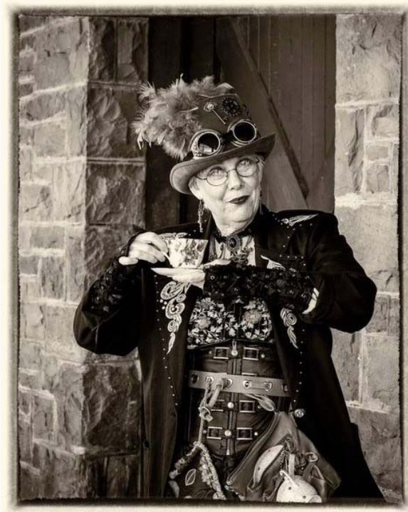
Photo of Mad Hattie

Travel back in time in Mad Hattie's time machine to meet Mary Cassatt and Clara Schumann, who share how they kept their creative spirits alive through many challenges.