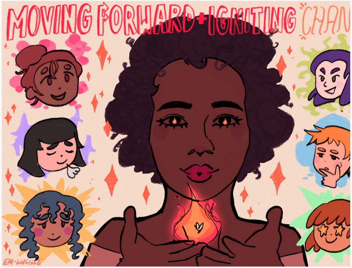
Moving Forward + Igniting Change

This conference will be both in-person in Santa Rosa and online everywhere on Saturday , August 10 , 2024 starting at 9 AM .