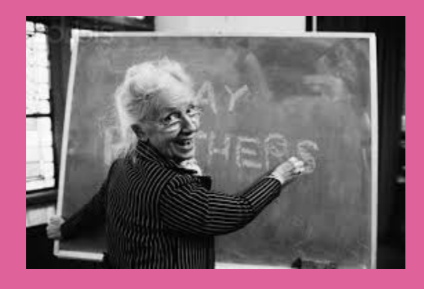
Special dates in August

Want to change how you receive these emails? You can update your preferences or unsubscribe