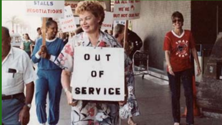
Dusty Roads, labor leader and gender equality pioneer