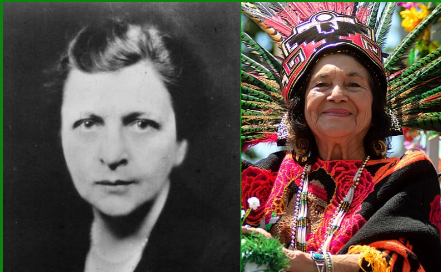
Frances Perkins (l) and Dolores Huerta (r)